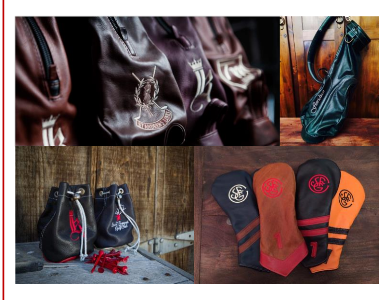
"Links & Kings is driven by the spirit of golf's past to create products that have a heritage on the links of yesterday combined with the performance demanded of the modern player."