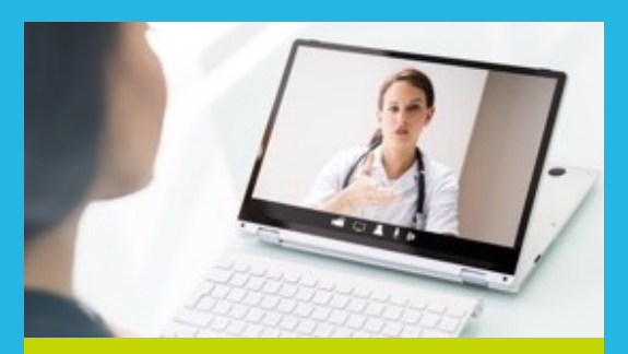
Access to care